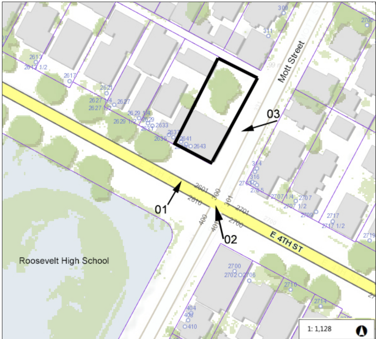
Base map